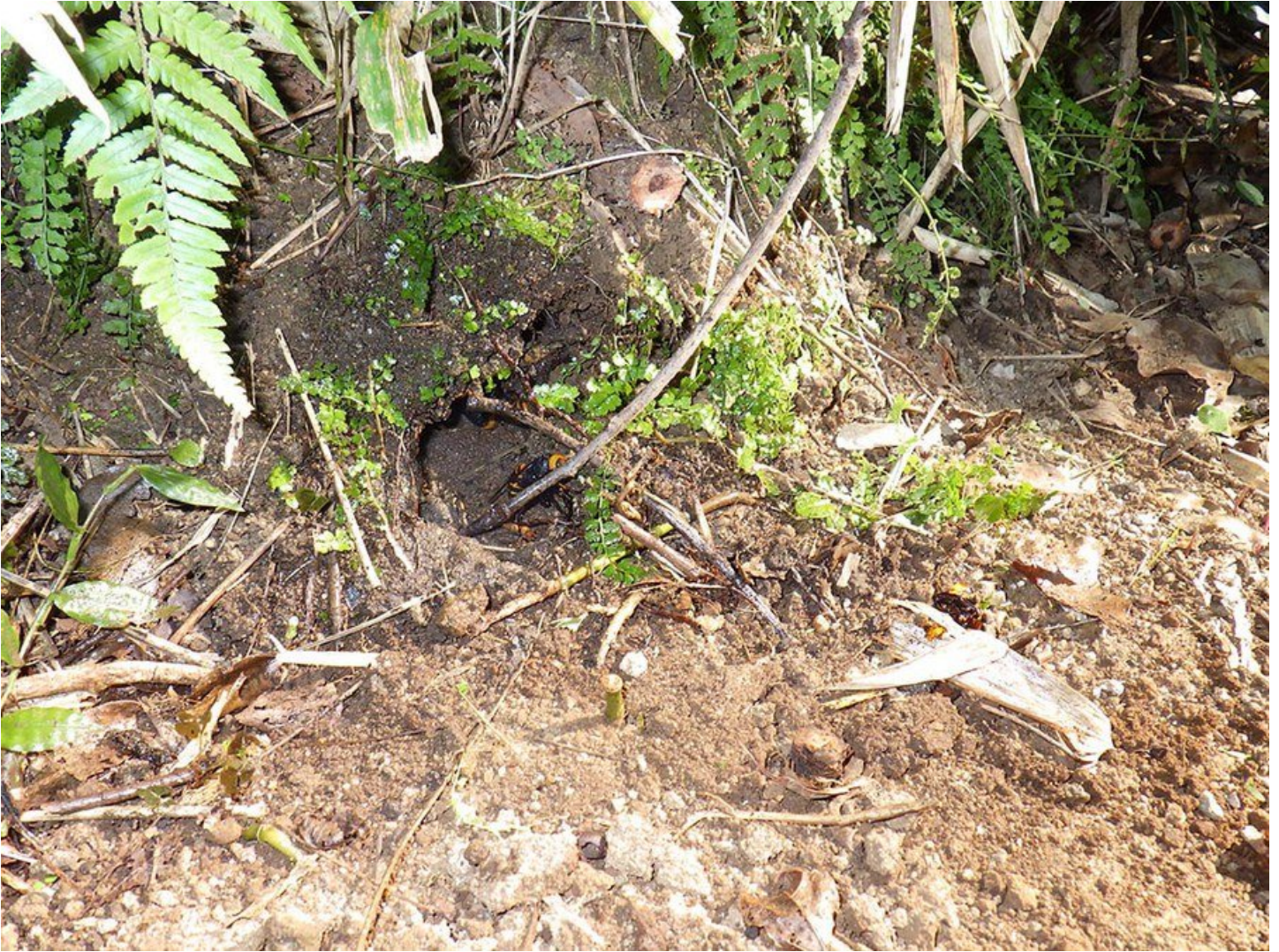
Figure 3. Entrance to an underground Asian giant hornet nest.