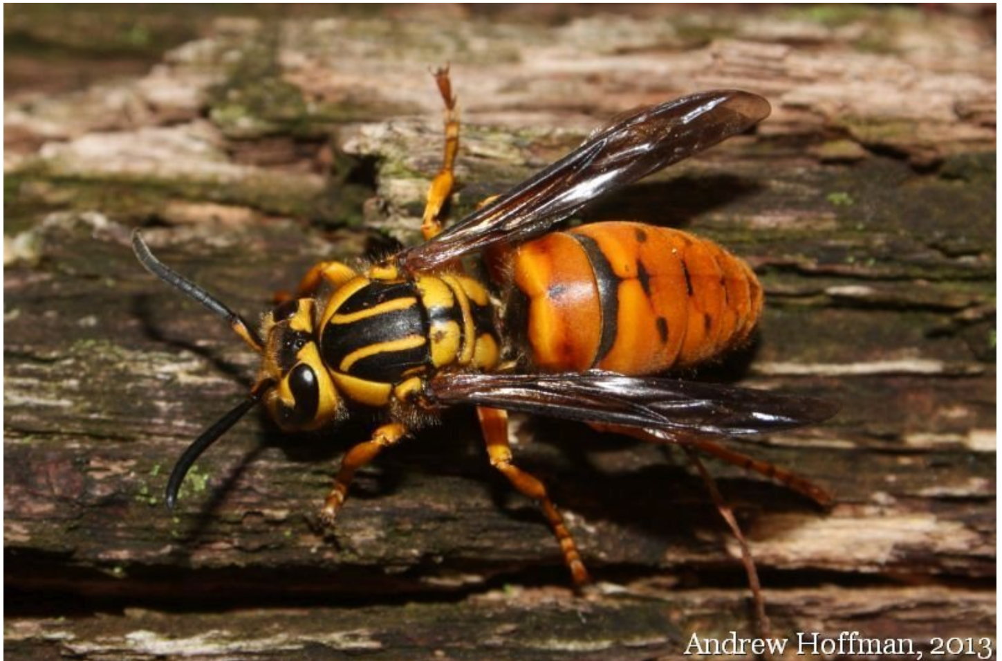
Figure 9. Southern yellowjacket queen. Note the longitudinal stripes on the prothorax.

are active in the spring. Southern yellowjackets can be distinguished from Asian giant hornets by their smaller size, differences in coloration, and the distinctive longitudinal stripes on the prothorax, which also distinguish southern yellowjackets from other Vespula species. Yellowjacket species in North America can be differentiated based on the pattern of the gaster (the "abdomen" of bees, wasps, and hornets); examples of different gaster patterns can be found here , here , and here . Different yellowjacket species preferentially build their nests in the ground or in aerial situations, such as under house eaves.