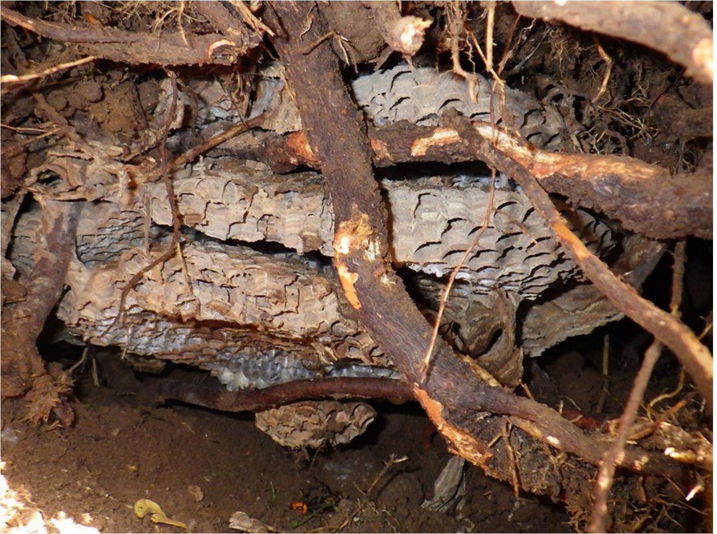
Figure 5. Excavated Asian giant hornet nest. Note how it is in and amongst the roots.