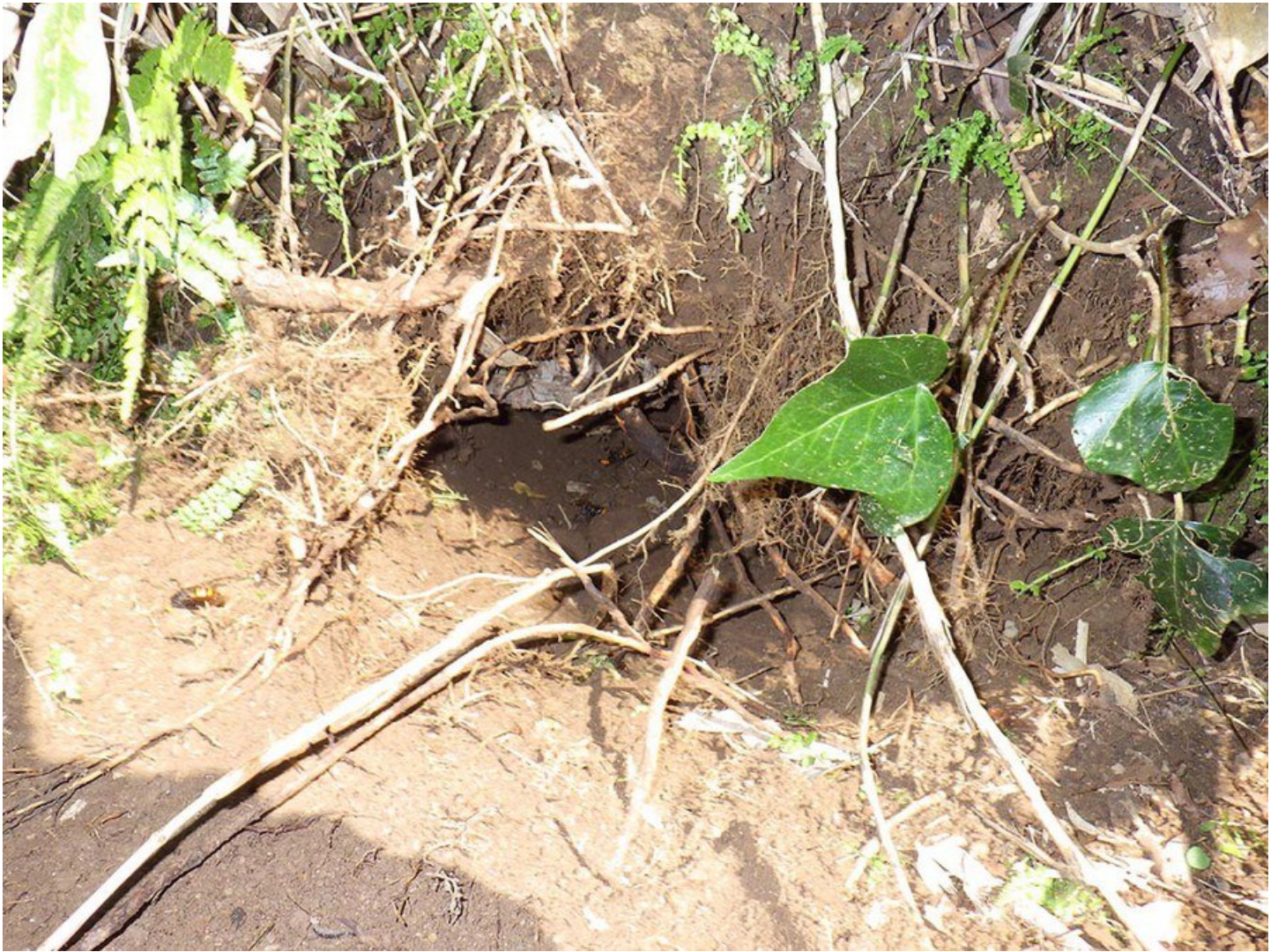
Figure 4. Partially excavated Asian giant hornet nest.