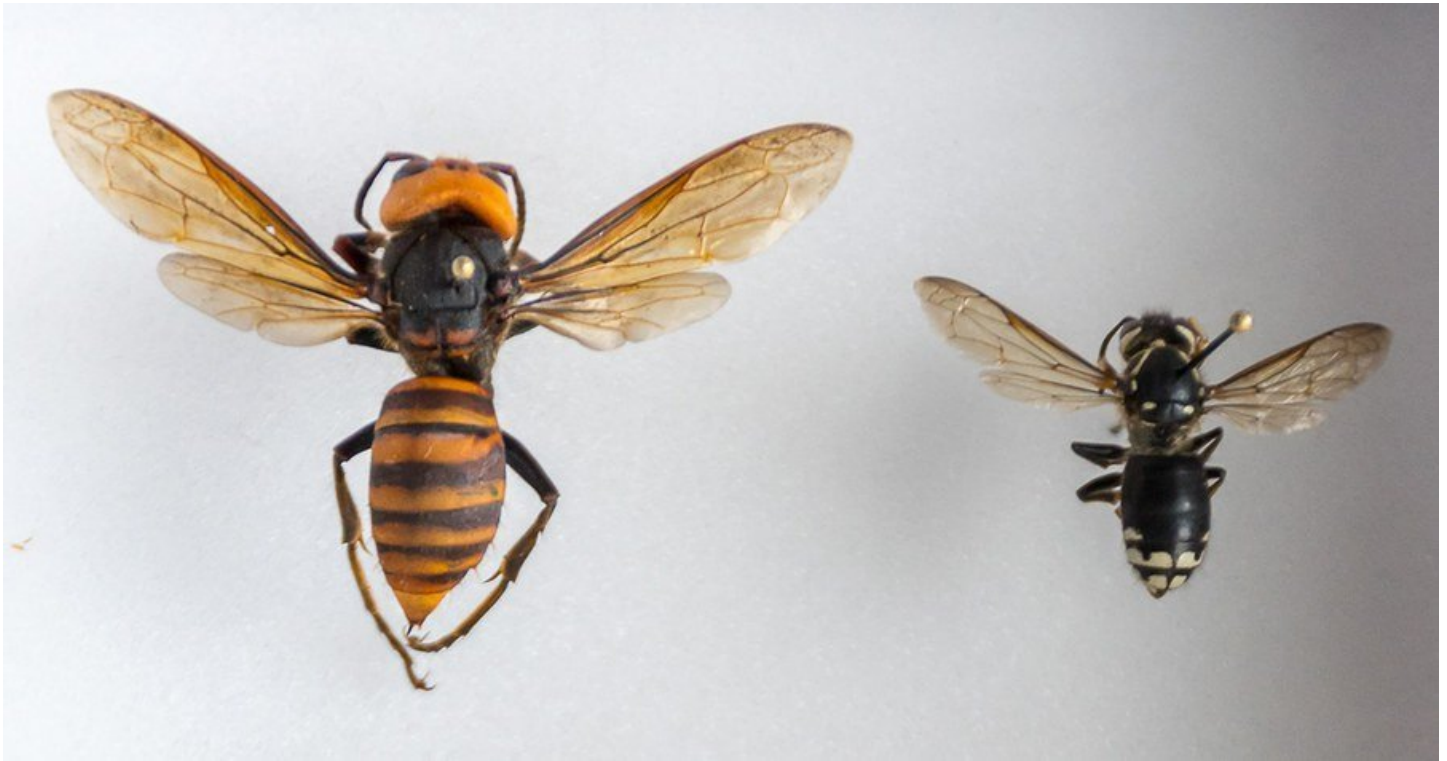
Figure 12. Asian giant hornet compared to a baldfaced hornet.