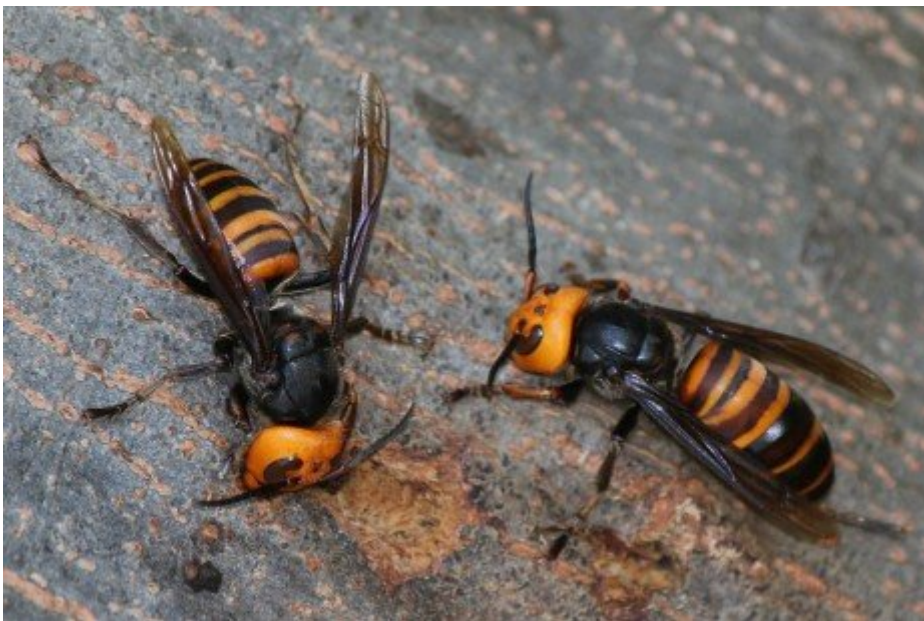
Asian giant hornets.