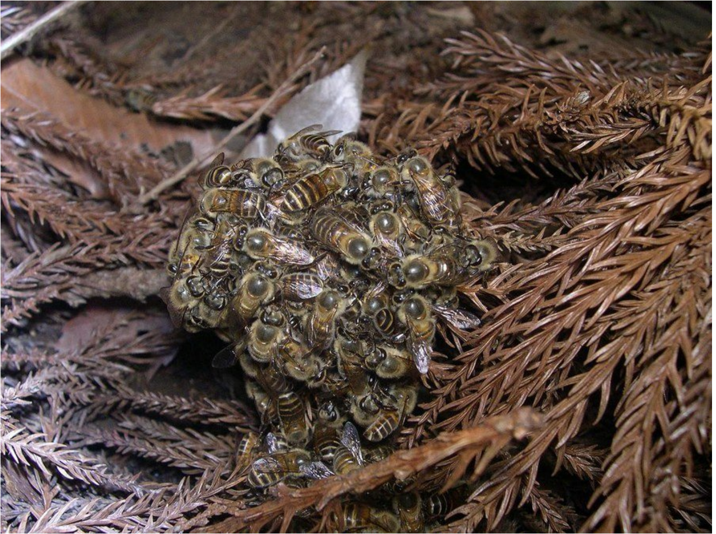
Figure 15. Japanese honey bees that have formed a ball around a marauding Asian giant hornet to kill it.

However, western/European honey bees ( Apis mellifera ), which are the species used in commercial honey production and did not coevolve with Asian giant hornets, do not form balls around hornets in this manner. Rather, individual guard bees attack the hornets in the air away from the nest. In this contest, the much larger hornet always wins. Because the hornets are targeting bees for protein, they only utilize the muscle-rich bee thorax and discard the head, abdomen, and legs. After the bee is killed, the hornet prepares the thorax into a "meat ball", which is carried back to the nest.