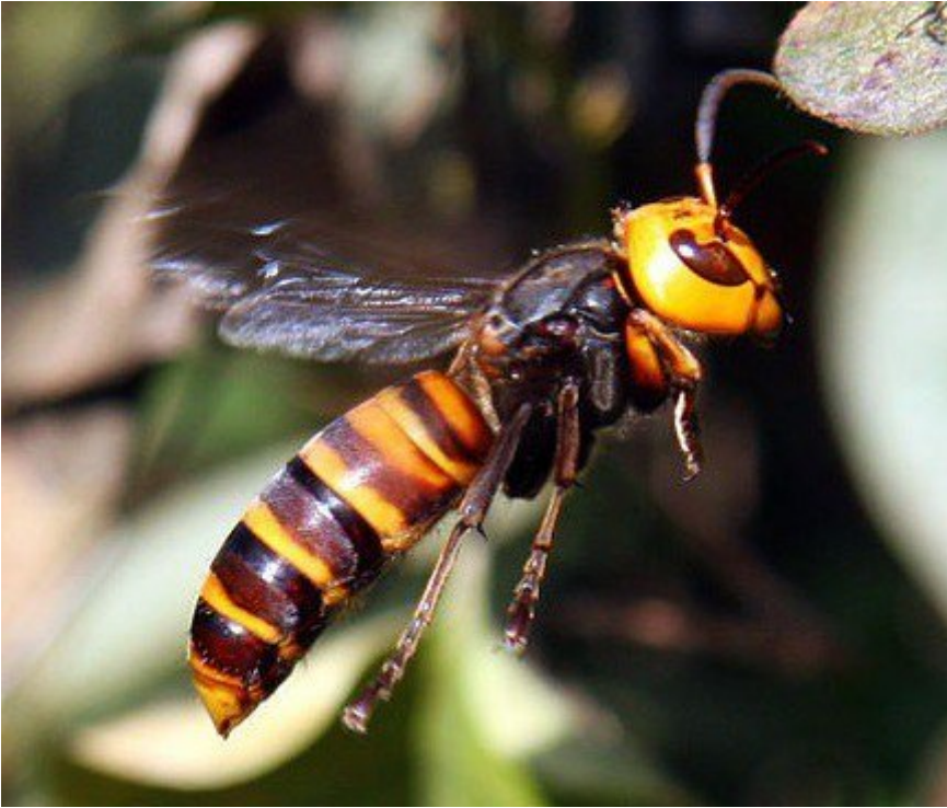
Figure 2. Asian giant hornet in flight. Photograph by Fufill via Wikimedia , used under a CC BY-SA 3.0 license. Cropped from original.

Asian giant hornets typically build their nests underground, usually in abandoned rodent burrows in forests, often in association with pine roots (Figures 3–5). Nests are sometimes constructed in dead, hollow trunks or roots of trees, but these are never more than 3 to 6 feet above the ground. Aerial nests are rare – of 1,756 nests examined in Japan, only three were constructed above ground. Because of their subterranean nesting habit, locating the nests of Asian giant hornets can be very difficult.