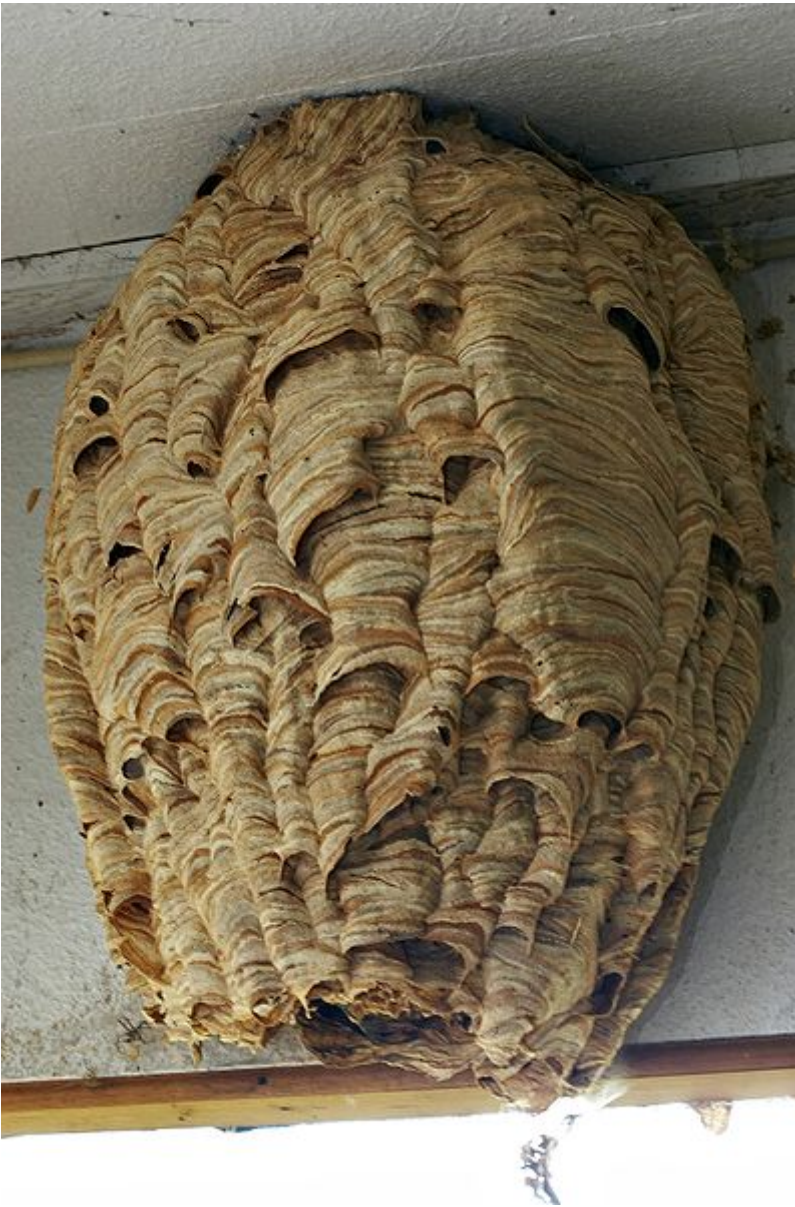
Figure 8. Exposed aerial European hornet nest built in a protected space.

Thirteen species of yellowjackets ( Vespula species) occur throughout North America, 10 of which are found in eastern North America. Most yellowjackets have abdomens that are banded with yellow and black, but are smaller in size (up to 0.5 inches) so unlikely to be confused for Asian giant hornets. However, queen southern yellowjackets ( Vespula squamosa ) (Figure 9) are larger than other species (up to 0.65 inches) and are sometimes confused for Asian giant hornets when they