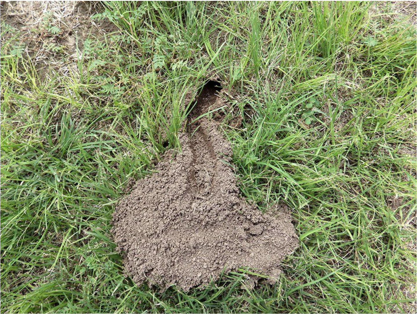
Figure 11. Cicada killer nest. Note the pile of dirt that leads to the nest entrance.

Bald-faced hornets ( Dolichovespula maculata ) (Figure 12) are native wasps that are important predators on caterpillars, flies, and other soft-bodied insects. They can be distinguished from Asian giant hornets by their smaller size, black and white coloration, and aerial nests that are commonly found on tree limbs and house eaves (Figure 13). For more information about bald-faced hornets, please refer to this Penn State Extension fact sheet .