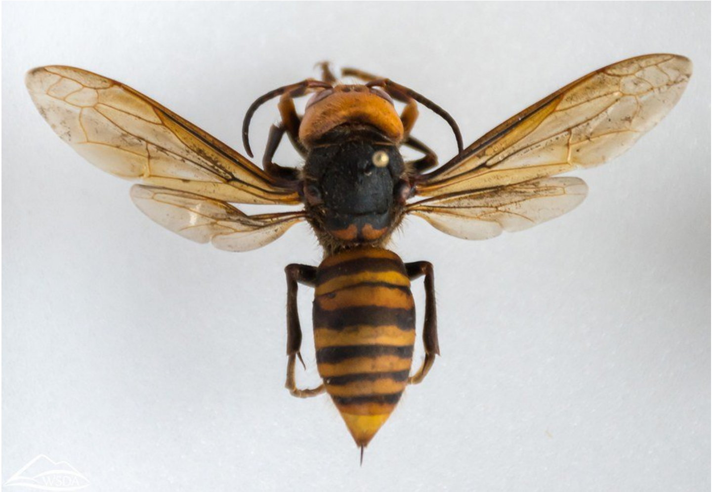
Figure 1. Asian giant hornet.