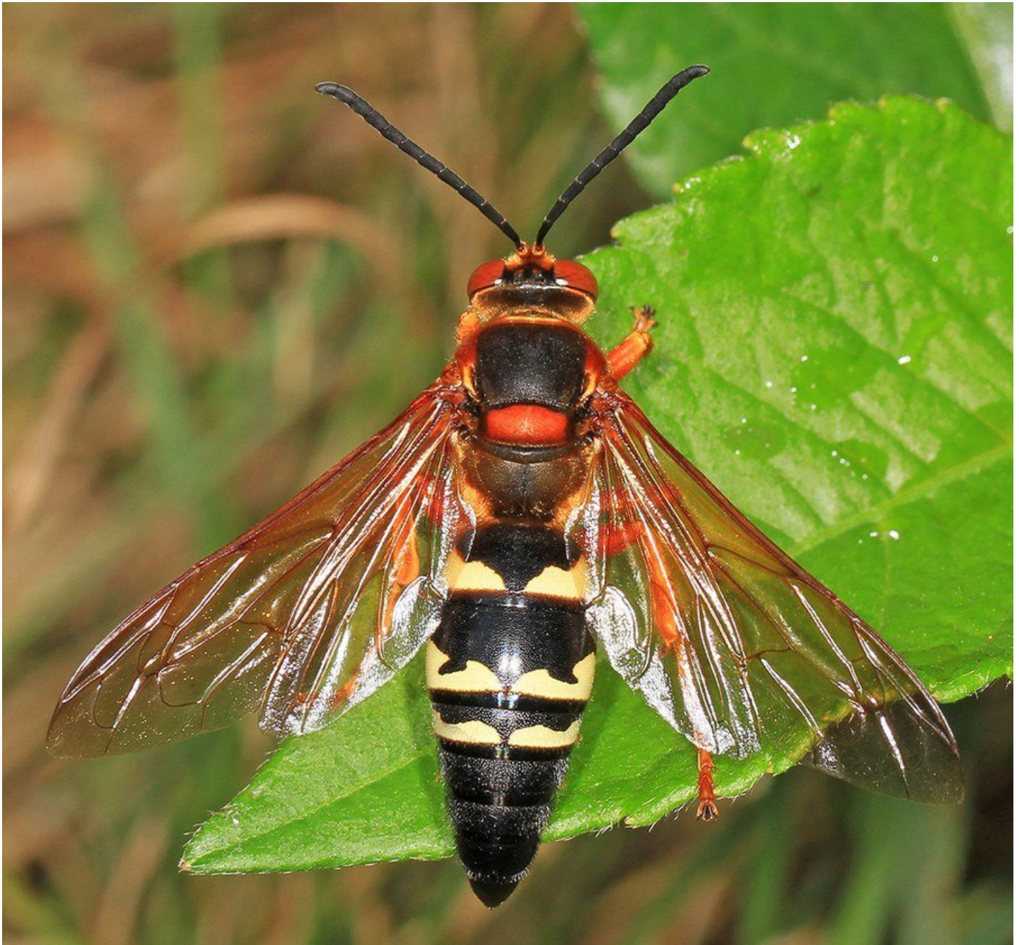
Figure 10. Cicada killer.

Both Asian giant hornets and cicada killers nest in the ground. However, cicada killers typically nest in exposed areas (e.g., lawns) and often create an obvious pile of dirt at the nest entrance (Figure 11), while Asian giant hornets typically nest in forested areas. Additionally, cicada killers are solitary, so each female digs her own nest. Cicada killers may nest communally, with many nests in a small area that has the right soil substrate, while Asian giant hornets do not.