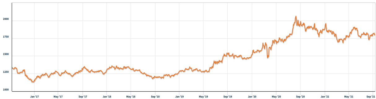
Figure 1: Gold daily prices, U.S. dollars per troy ounce.

Market traders buy and sell volatile assets frequently, with a goal to maximize their total return. There is usually a commission for each purchase and sale. Two such assets are gold and bitcoin.